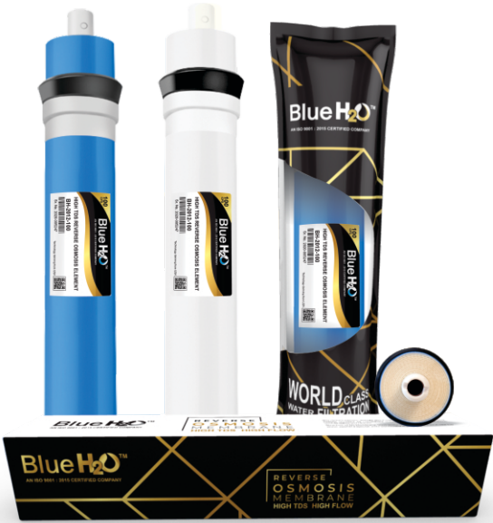
MEMBRANE : 80 -100 GPD