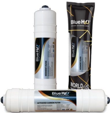
INLINE FILTER BH- 01