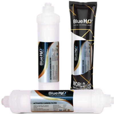
INLINE FILTER BH- 02