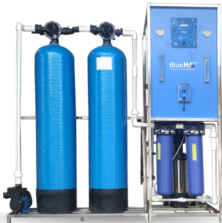
500 / 1000 LPH